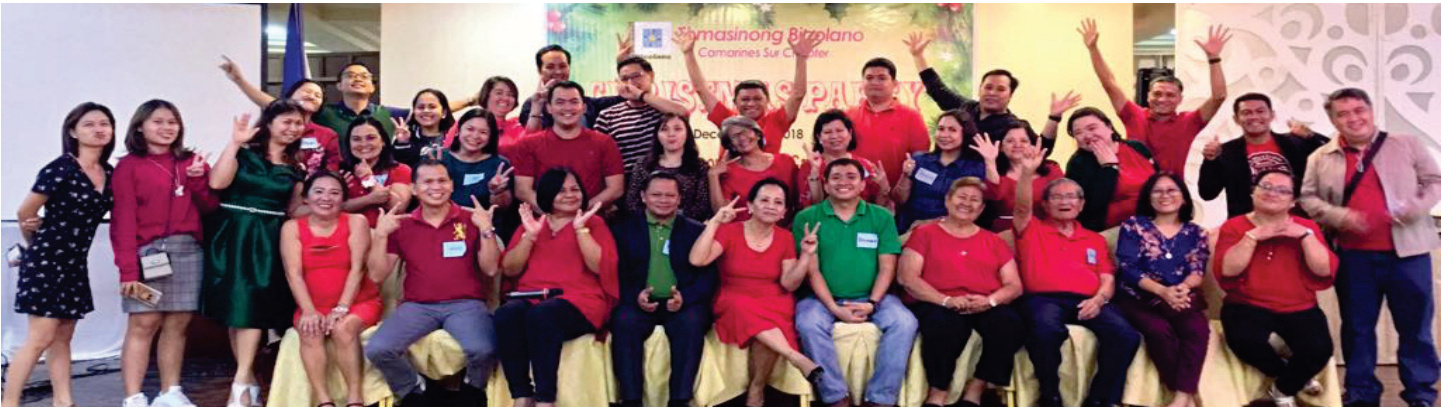
Merry Christmas from Tomasinong Bikolano CamSur Chapter!