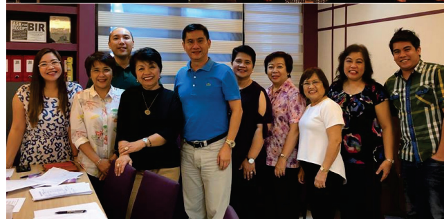
Relief for Bicol from Pharmacy Alumni