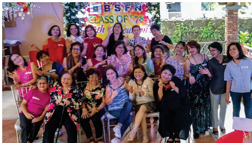
UST BSN Batch '78 REUNION Christmas Party, November 30, 2018 at Villa Leonila Events Place, St. Joseph Village I, San Vicente, San Pedro, Laguna.