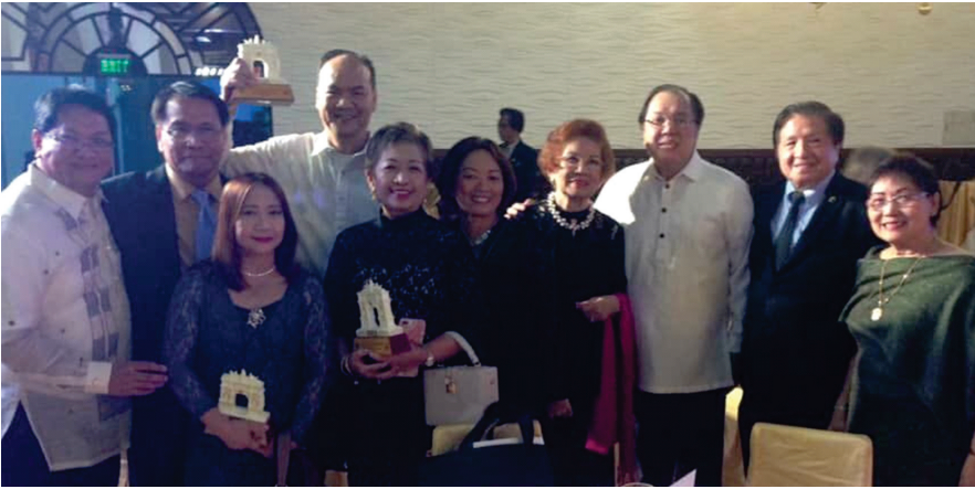
Some of the Distinguished Alumni luminaries from the UST Law Alumni Foundation and our Regional Chapters: Tomasino BIKOLANO, Tomasinong KAPAMPANGAN and UST SOCCSKSARGEN. We are proud of you all!!