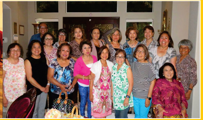
Members of the USTNAI San Diego – the 2018 Annual Convention Host Chapter