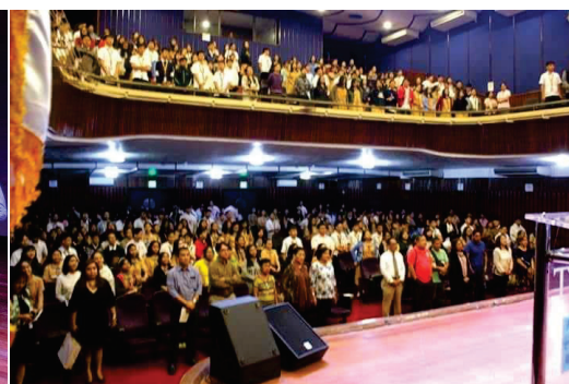
University of Santo Tomas Education High School