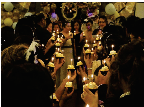
Blowing of the 50 gold cupcakes symbolizing the golden celebration.