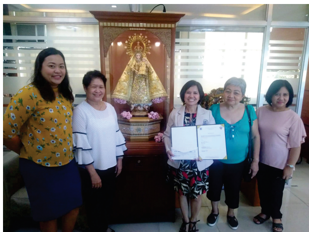
Received on behalf of CEAFI a donation from BSN alumni Batch '73 with an amount of P100k for the BSN activities.