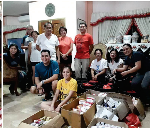
Tomasinong Bikolano Albay and CamSur preparing relief goods for the flood land slide affected areas in each provinces.