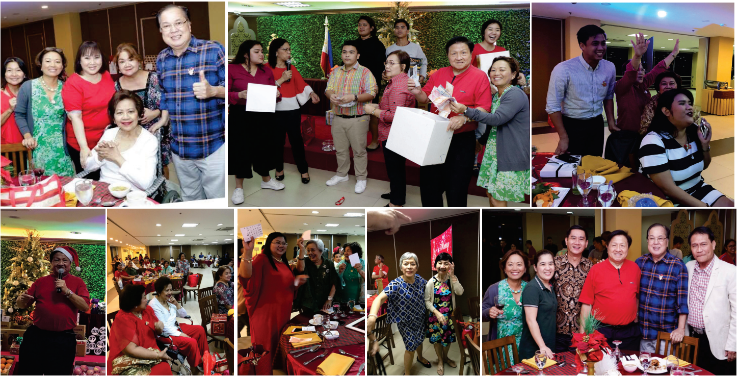
The UST AAI & OAR Combined Alumni Christmas Party . . . Merriment, Happiness, foods, gifts super galore! Happy Holidays everyone!