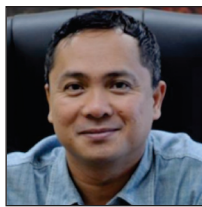
MAYOR PETER MIGUEL Koronadal City, South Cotabato