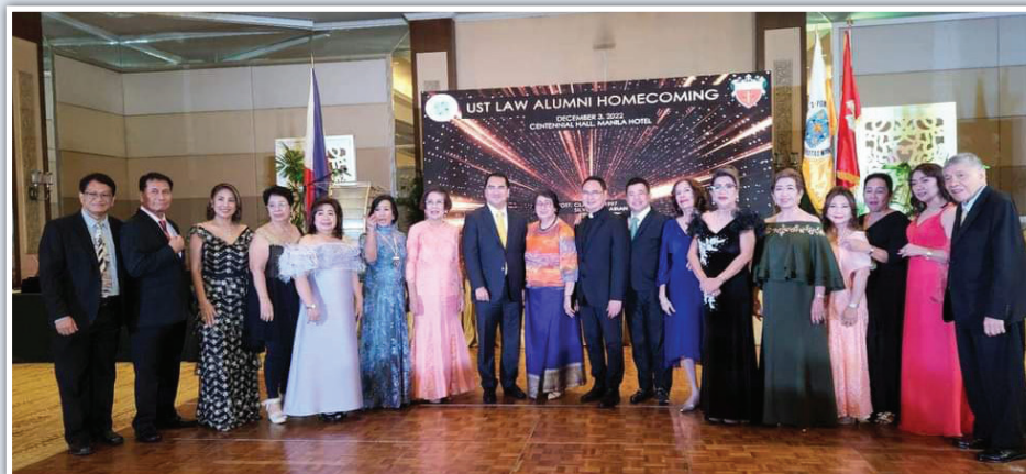
USTLAFI Trustees, Officers and Consultants