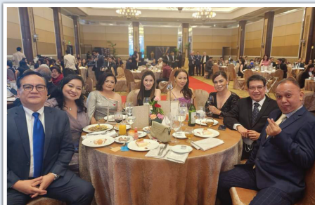
Alumni Event Attendees