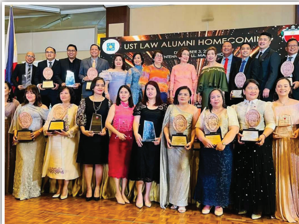
Alumni Awardees pose for a photo.