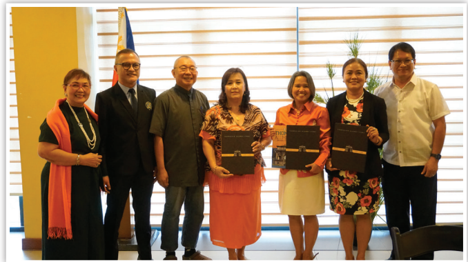
BOTTOM: CEAFI Thomasian Icons were recognized for their outstanding contribution to their Alma Mater.