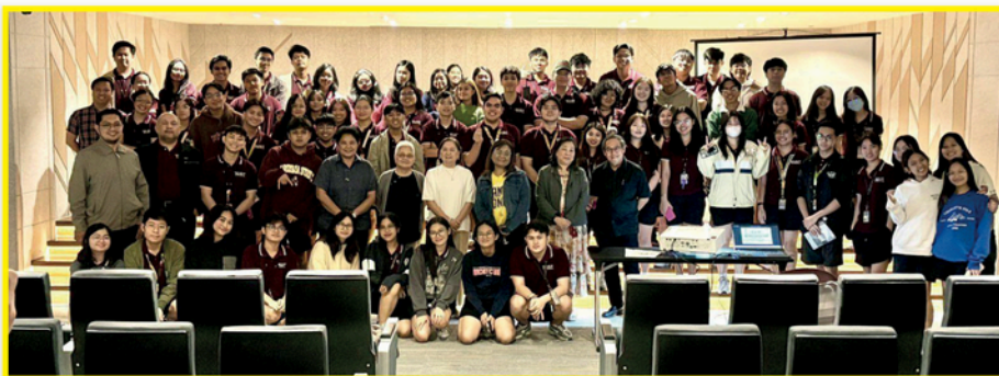
After the awarding of certificates, the USTCAAAI Board, guests, speakers, and emcee posed for a picture with the future architects to conclude the event.