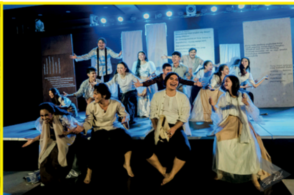
Lipa Actors Company