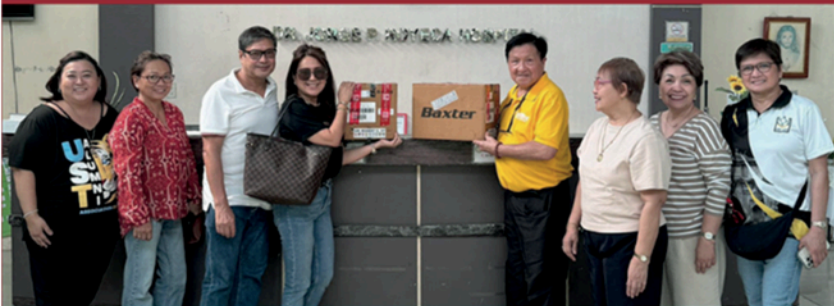
TACFI donates Baxter anesthesia to SOCCSARGEN and Tomasining Kapampangan