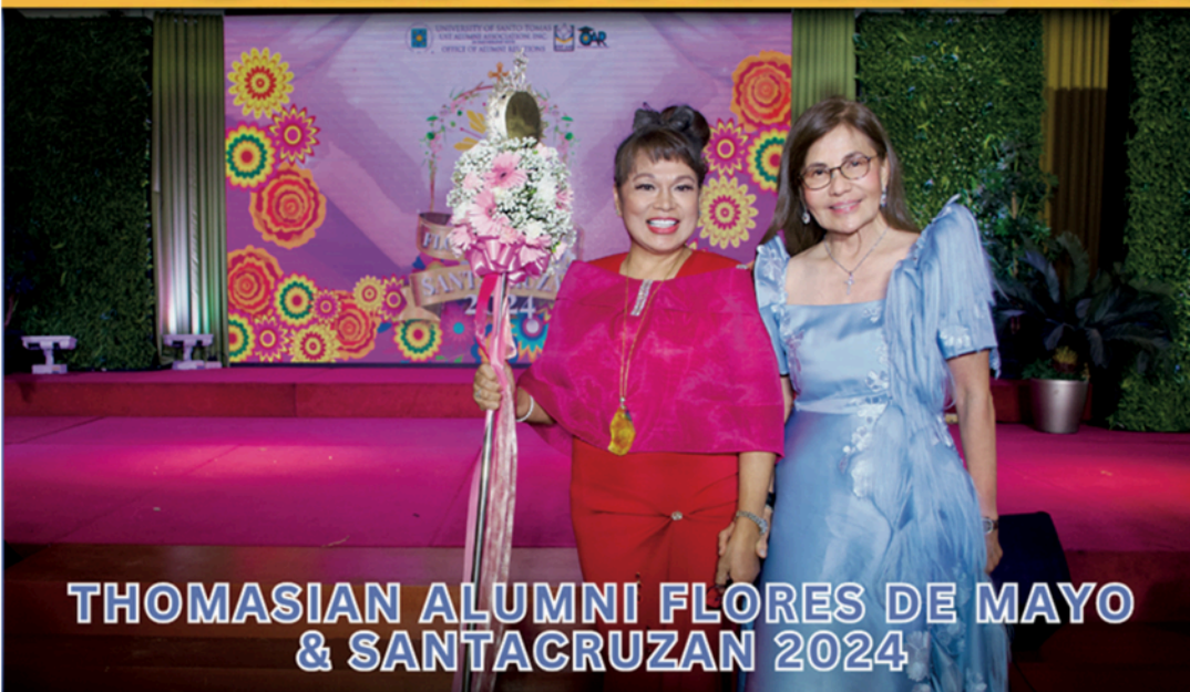
THOMASIAN ALUMNI FLORES DE MAYO & SANTACRUZAN 2024