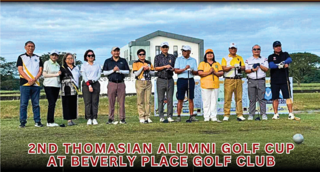
2ND THOMASIAN ALUMNI GOLF CUP AT BEVERLY PLACE GOLF CLUB