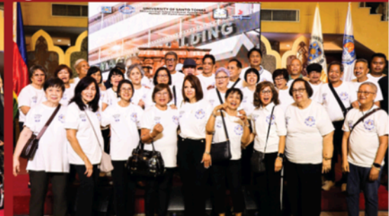
UST Atelier Alumni Association, Inc. Vision Versatil Art Caravan