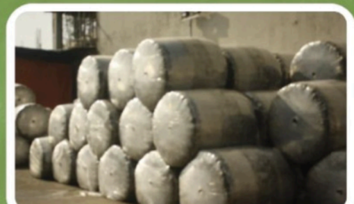
REFUSED DERIVED FUEL (RDF)