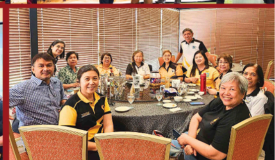
UST EHS @ 75 Multi-Batch Alumni Homecoming