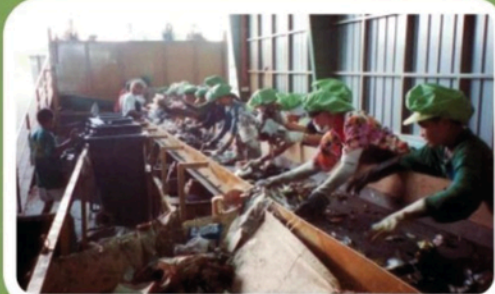
MATERIALS RECOVERY FACILITY