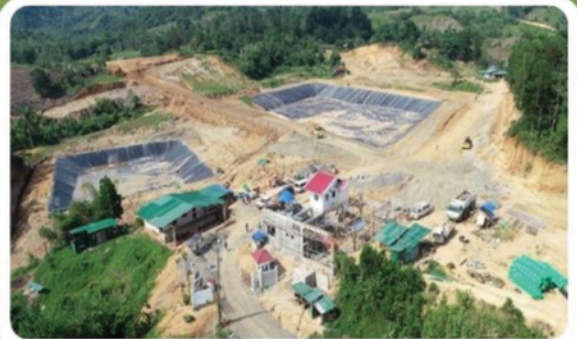
LANDFILL CONSTRUCTION, OPERATION AND MAINTENANCE