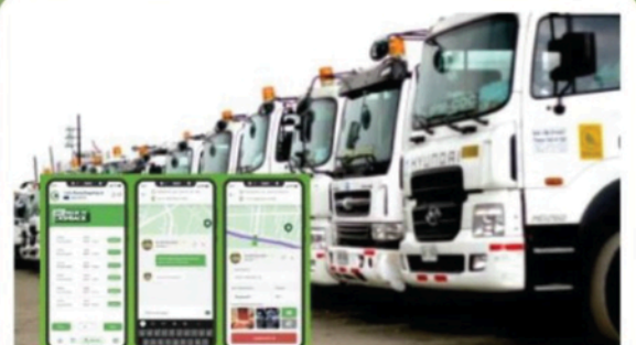
GARBAGE HAULING AND DISPOSAL