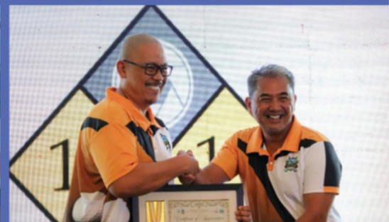
UST College of Tourism & Hospitality Management Alumni Meet 2025