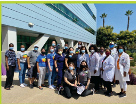
Partnering with African American healthcare professionals