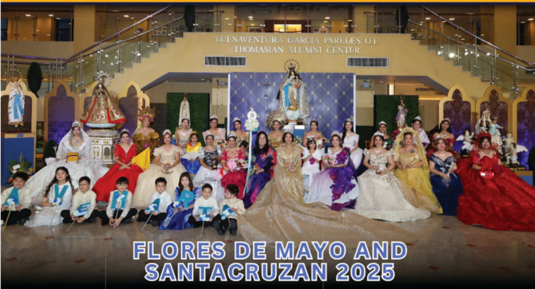
FLORES DE MAYO AND SANTACRUZAN 2025