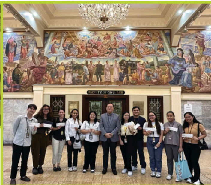
UST LAFI 1st-Year Scholars with their scholarship checks from the association president.