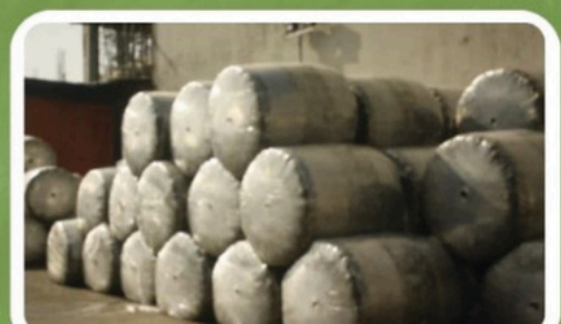
REFUSED DERIVED FUEL (RDF)