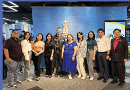
UST AMV Accountancy Alumni Association giving support to examinees at the CPALE testing centers