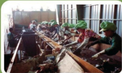
MATERIALS RECOVERY FACILITY