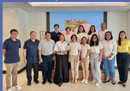
UST Pax Romana Alumni Association's Pilgrims of Hope, Jubilee 2025