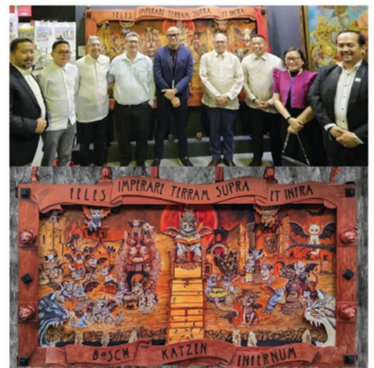
Oil on canvas, 48in x 96in, Sculptured Frame, Wood and Plaster of Paris, 60in x 108in Nestor Perez Ong in collaboration with Ding Royales, and Carlo Garrido

PEKTO'S INFERNO {Bosche Katzen Infernum} is a surreal reimagining of Bosche's classic infernal imagery, where the devils, instead of being grotesque and terrifying, are depicted as cute, mischievous cats with bat wings. This playful inversion of the classical hellish creatures offers a whimsical contrast to the usual depictions of demonic figures as menacing and fearsome. The cats, with their large, expressive eyes and tiny bat wings, seem more playful than sinister, creating a paradoxical visual that both delights and unnerves. In this tableau, created via gallons of caffeine, endless blues music, and the combined smell of turpentine and cat urine, the typical dread of the underworld is replaced by an eerie amusement, where the danger lies not in fiery torment but in the capricious antics of these winged kittens. This juxtaposition of cuteness and malevolence creates an intriguing atmosphere where humor and horror coexist, forcing viewers to confront their own expectations of the infernal realm. The cutesy devil-cats punish the trespassers of the seven deadly sins while Lucipurr, the cat in the high throne, oversees everything. This fantastical surreal landscape is encased in a sculpted wooden frame complete with gargoyles of cats and tarsiers. This is a diorama we created for Spectro Lucid's art pageant at World Art Dubai 2025