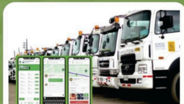
GARBAGE HAULING AND DISPOSAL